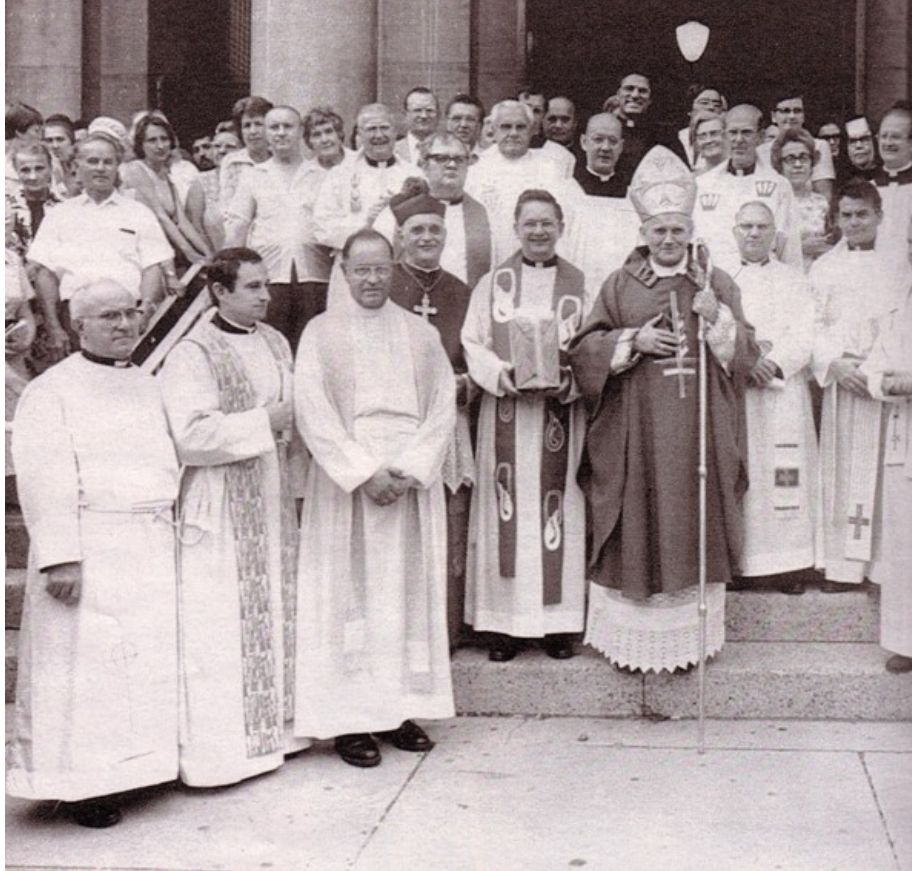
John Paul II in Detroit, prior to becoming an antipope, wearing an upside-down cross vestment