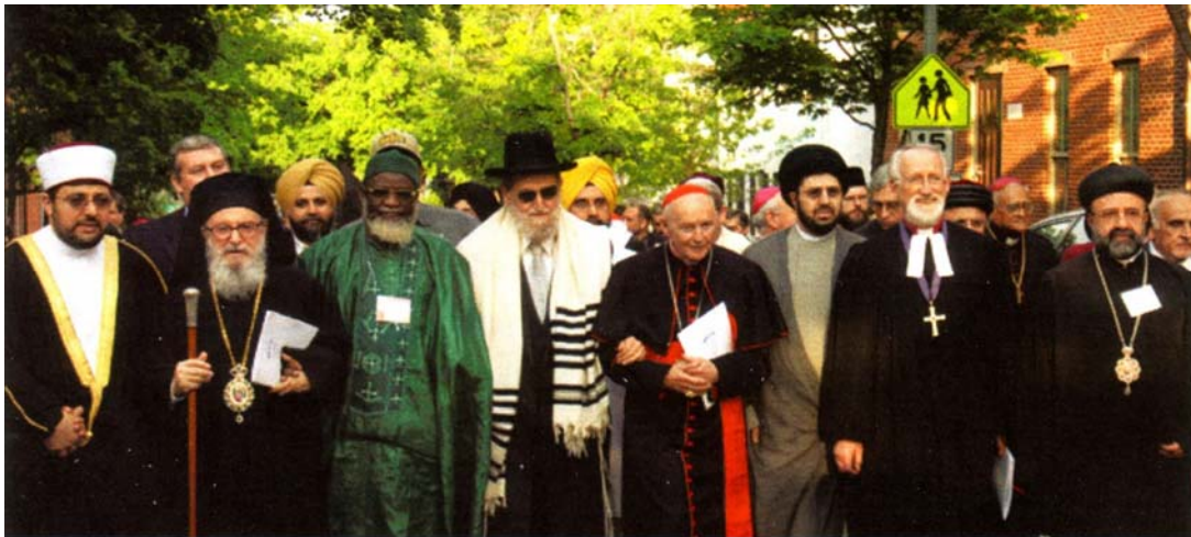
2006 Interfaith Apostasy at Georgetown in commemoration of Assisi 18

So, the “priest” teaching at “Catholic” Georgetown University admits that he doesn’t want to convert people to the Catholic Faith, but rather to “convert” them to a deeper understanding of their own faiths, whatever they may be. And the purpose of his course “Problem of God” is to bring about an acceptance of all religions. This is total apostasy.